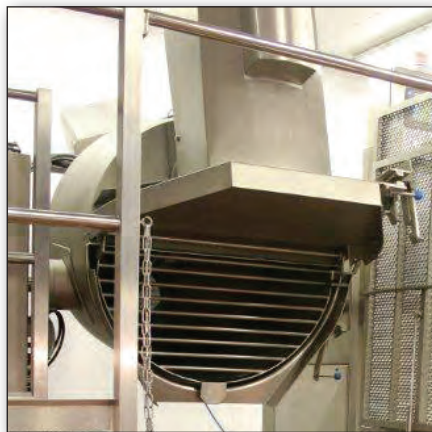
AdPro Mix 500

The Advanced Engineering AdPro Mix is specifically designed for flexible processing of cold manufactured food products