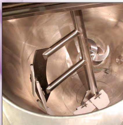
AdPro Mix with variable speed anchor/stirrer and cutting blades

The variable speed anchor/stirrer and chopping head which can be inter-changed with a high shear rotor/stator head gives built in flexibility to blend, chop, mill, disperse and emulsify. With a recipe system fitted as standard and rapid clean-down between batches, the AdPro Mix offers high production rates whilst giving the flexibility to manufacture several different products per day